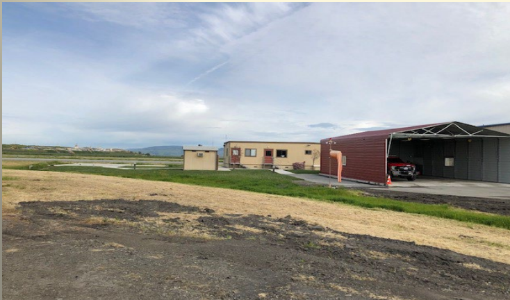
Station 3-The Airport