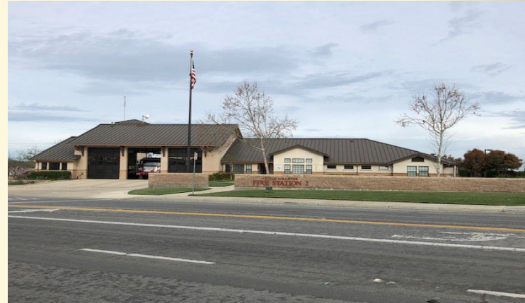
Station 2-Southern Hollister