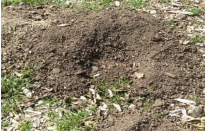
Gopher Hole and Mound - Tripping Hazard