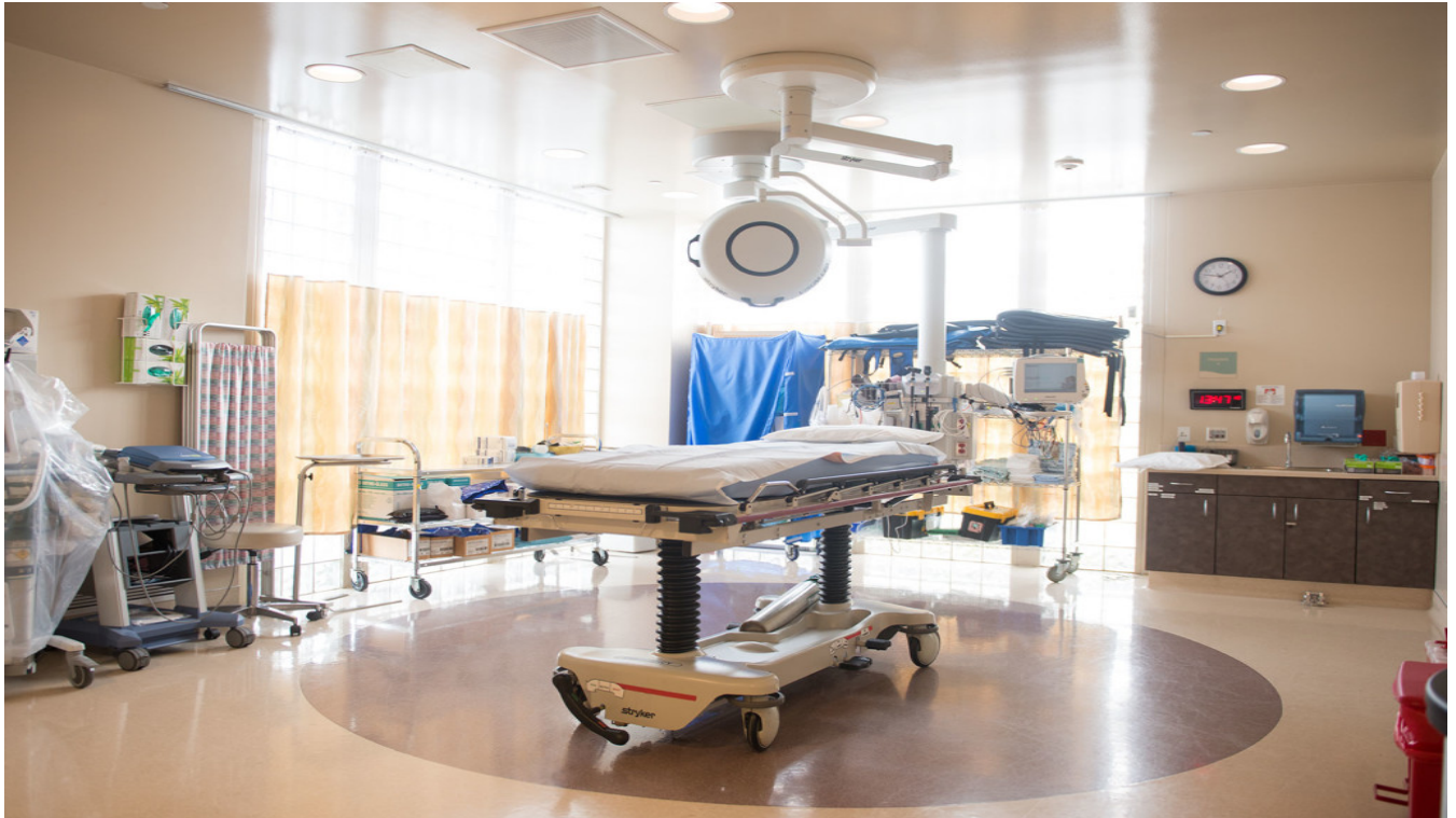
Hazel Hawkins Hospital Emergency Department Trauma Bay.