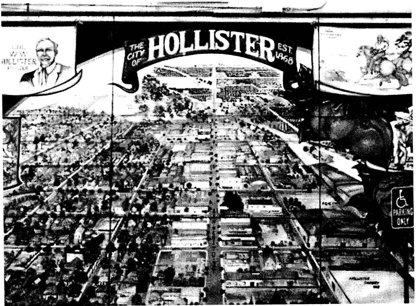
1mural.jpg